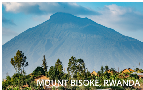
MOUNT BISOKE, RWANDA